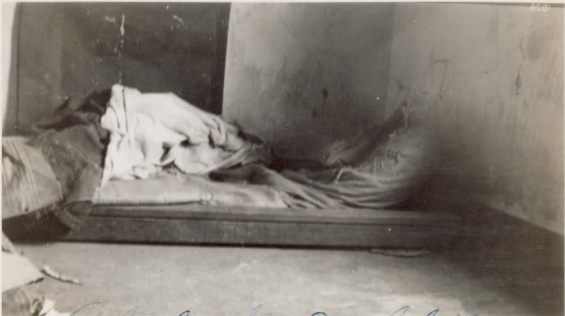
Dependant's Exhibit No. 3