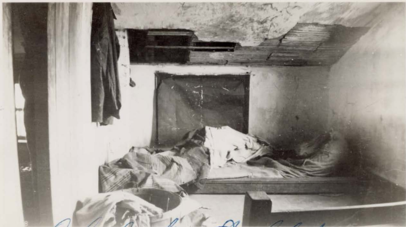
Defendant's Exhibit No. 2