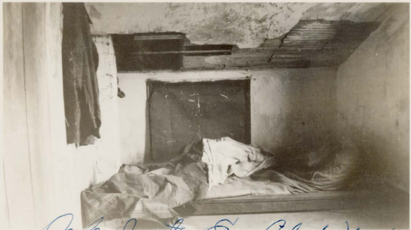
Defendant's Exhibit No. 4